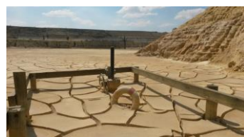
How the Rainbow Nation dried up | Can South Africa regain its adaptive capacity after suffering its biggest ever drought | By Tony Turton