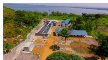
MWAUWASA: Working for the Sustainability of Water Supply and Sanitation Services in Mwanza, Tanzania