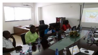
Technical Training: Volta Basin (March 2017)