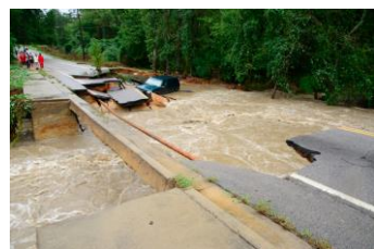
A different type of complaint for a changing climate